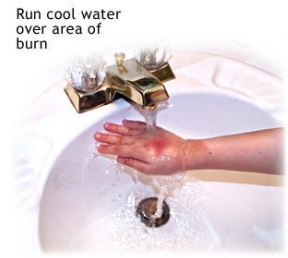
Run cool water over area of burn

15. You are running a burn under cold water, how long is it recommended that you cool the burn down for?