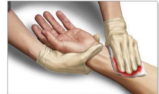
Apply direct pressure on external wounds with sterile cloth or your hand, maintaining pressure until bleeding stops

12. What is the first thing you should do before treating a casualty who is bleeding? (See picture for clue)